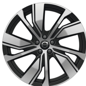
20" 5 V Spoke (#1133)