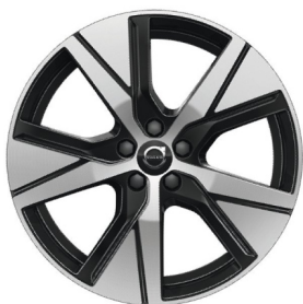
19" 5 Spoke (std Recharge)